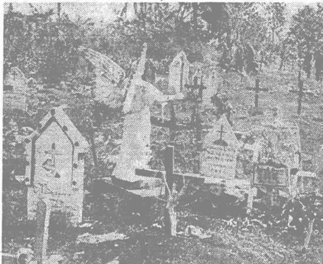
OLD CEMETERY NEAR GARAPAN —Soldiers, in the background, pass through an old Chamorro cemetery near Garapan, on Saipan Island, in the Marianas. A wooden angel stands in the foreground.