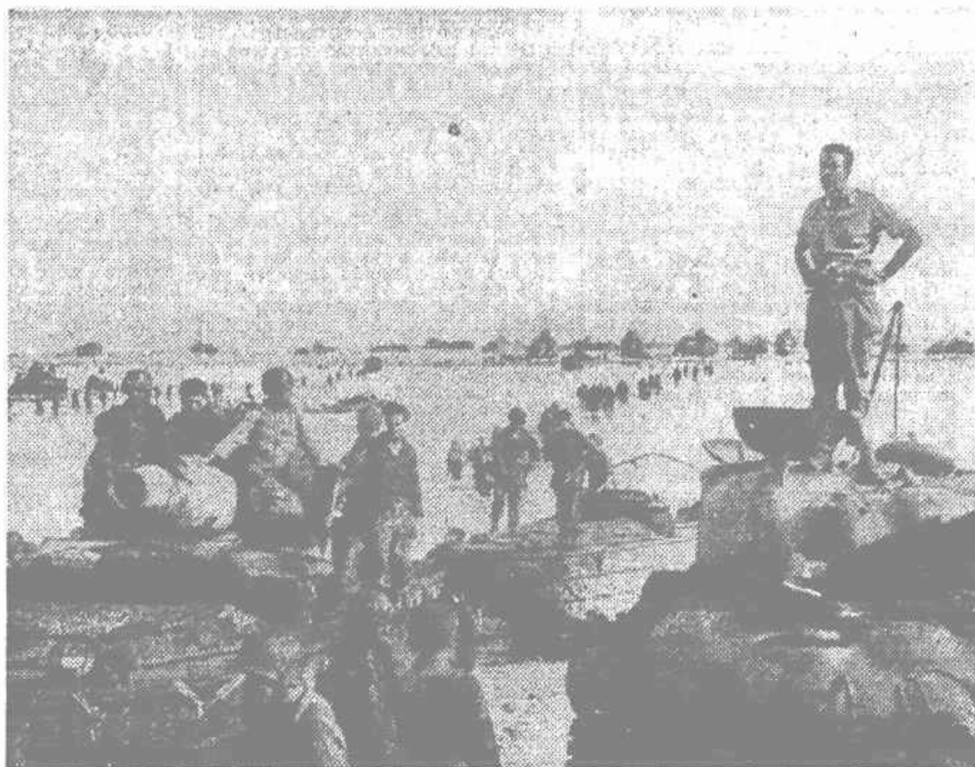
AMERICANS LAND ON NOEMFOOR —Troops come ashore on island where they quickly smashed the Japanese garrison and seized three important airfields. Ducks and tanks are in foreground. U. S. victory was a swift one.