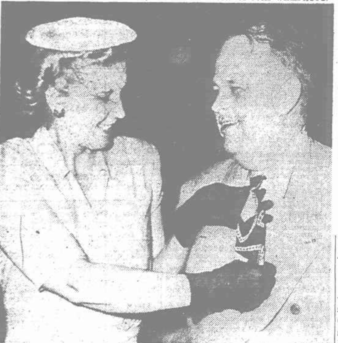
KEYNOTER'S TIE STRAIGHTENED —Gov. Robert S. Kerr of Oklahoma, keynote speaker at the Democratic national convention, gets his tie straightened by Mrs. Kerr after their arrival in Chicago.

'RUBBERNECK' CAR QUILTS Kansas City, Mo. (U.P.)—Kansas City's open air sightseeing street car, The Scout, has become a war casualty. The Public Service management said two operators could not be spared from regular runs to take care of the special car.