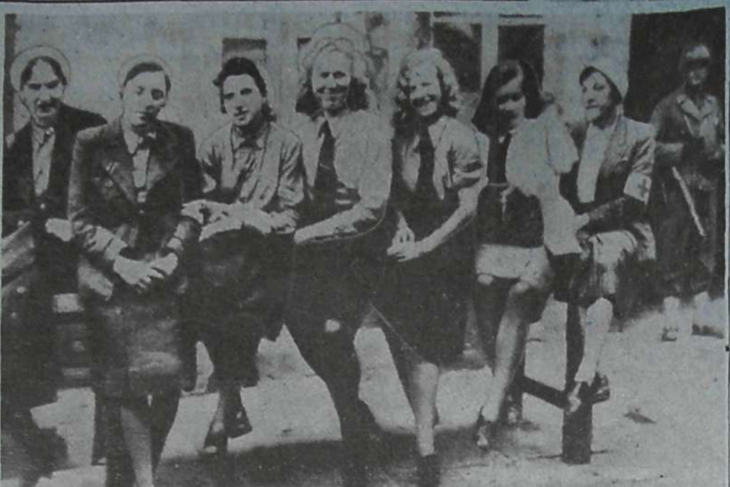
CAPTURED GERMAN NURSES. (AP—Radio-Wirephoto). These German Army nurses, who were captured when the Allies stormed into Cherbourg, sit on a bench awaiting transportation by two ambulances to the German lines, under a flag of truce. As soon as they were returned, the battle was resumed.

HOUSEHOLD FINANCE Corporation 3rd Floor, Low Theatre Bldg., 108 W. Jefferson St. Phone: 2-6145, SYRACUSE