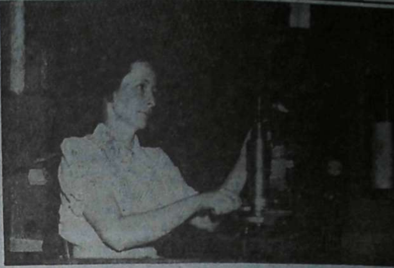
She's WORKING . . . not waiting . . . for VICTORY!

SUMMER LIBRARY HOURS Waterloo, July 5. — Waterloo Public Library will be open Monday, Thursday and Saturday from 3 until 5 P.M. and from 7 until 9 P.M. during July and August.