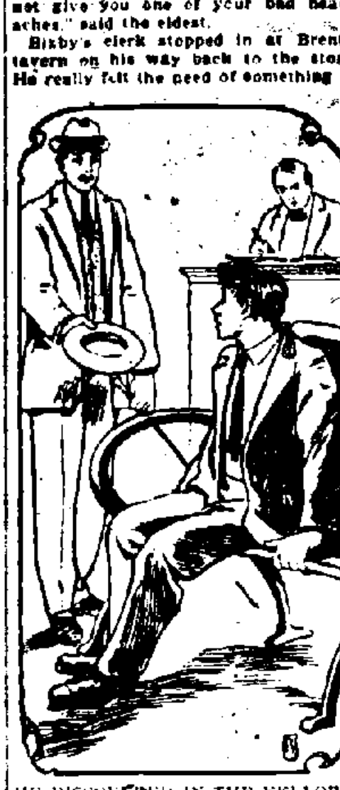
HE DISCOVERED IN THE FELLOW'S HAND HIS STRAW HAT.

It is getting hard on trigger. Bixby from dizziness, I suppose. The eldest Miss Dalton picked the straw hat up and wiped off the Florence table carefully with the sleeve of the wrapper she had drawn over her nightgown.