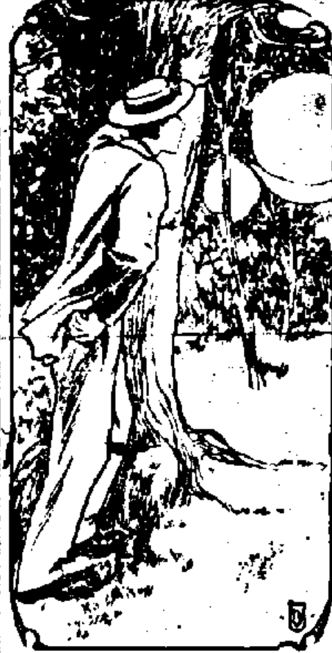
HE STUN ABOUT WITH HIS HAND TO HIS PISTOL POCKET.