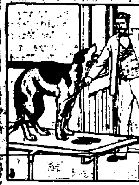
BUM SUMMONS THE SURGEONS.