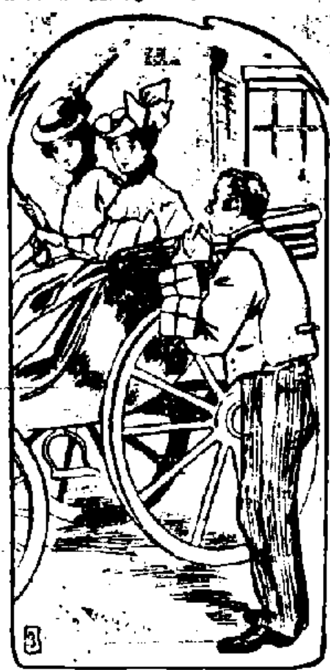
RIGHT YOU ARE, MY DEAR YOUNG LADIES.