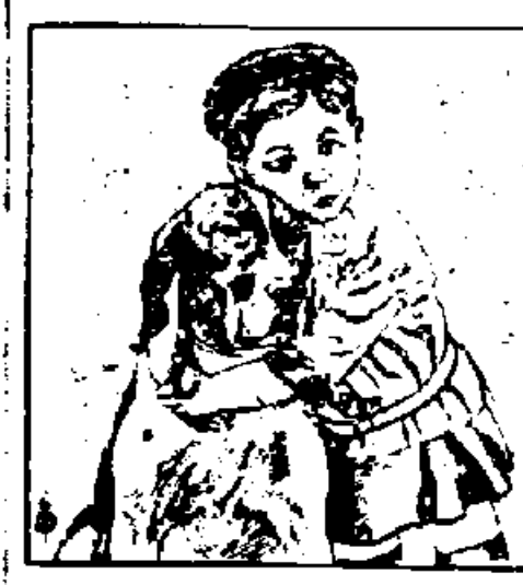
THE TWO COMRADES.

In Austria dogs are used to haul delivery wagons for the baker, meat man, grocer and milkman. In Vienna every morning one of the commonest sights is a bread wagon pulled high with loaves and rolls and a good sized dog hitched to it toiling to pull it from door to door.