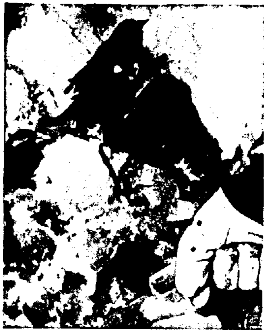
ICE-BOUND BLACKBIRDS—An ice pick is used to free these blackbirds encased in ice at Lake Overholser, Oklahoma City. More than 100 birds were trapped when they came down on the ice during a rain storm only to be caught by a sudden freeze.