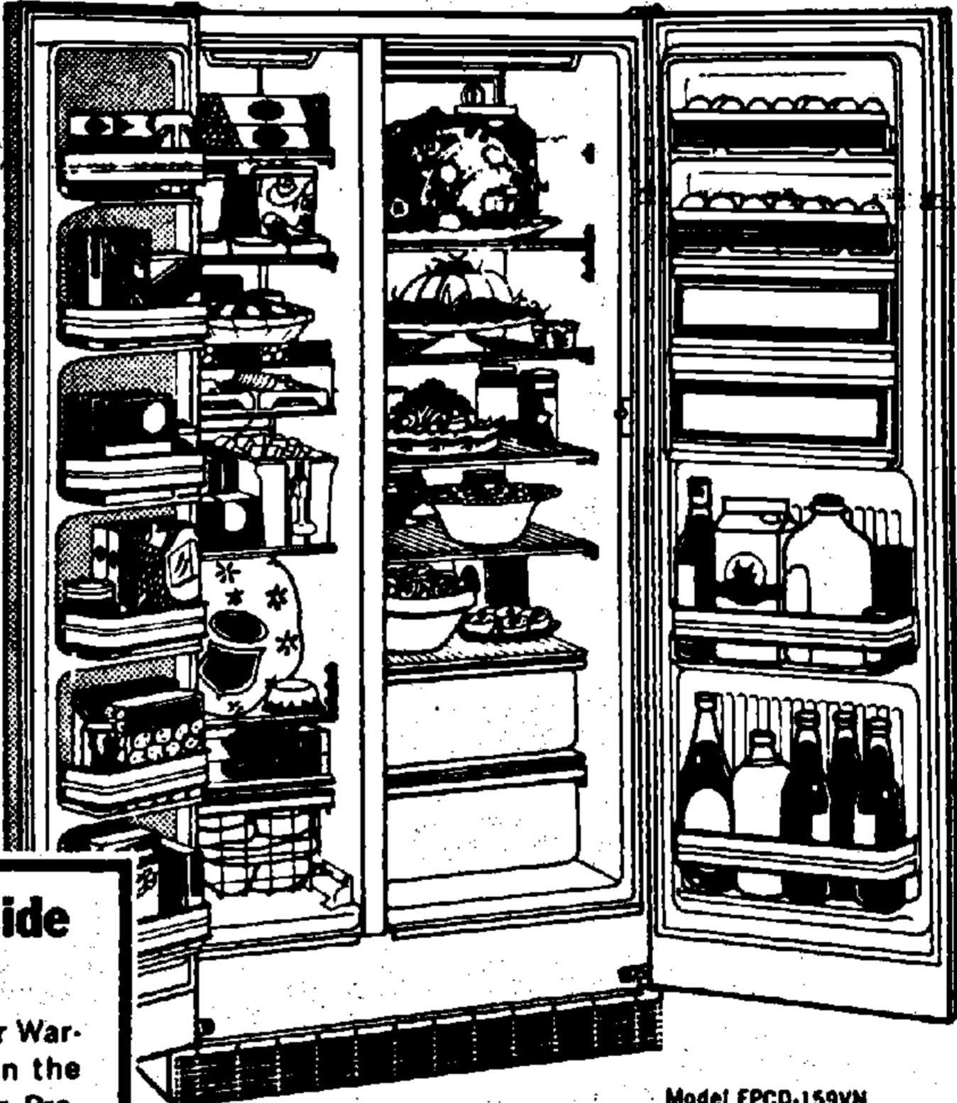
Model FPCD-159VN 15.9 cu. ft. (AHAM standard)

GM 5-year Nationwide Warranty Backed by General Motors! 1-year War- ranty for repair of any defect in the entire refrigerator, plus a 4-year Pro- tection Plan for repair of any defect in the refrigerating system.