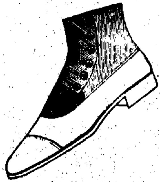
Dreadnought Gray Cloth top. Gun Metal $3.25.