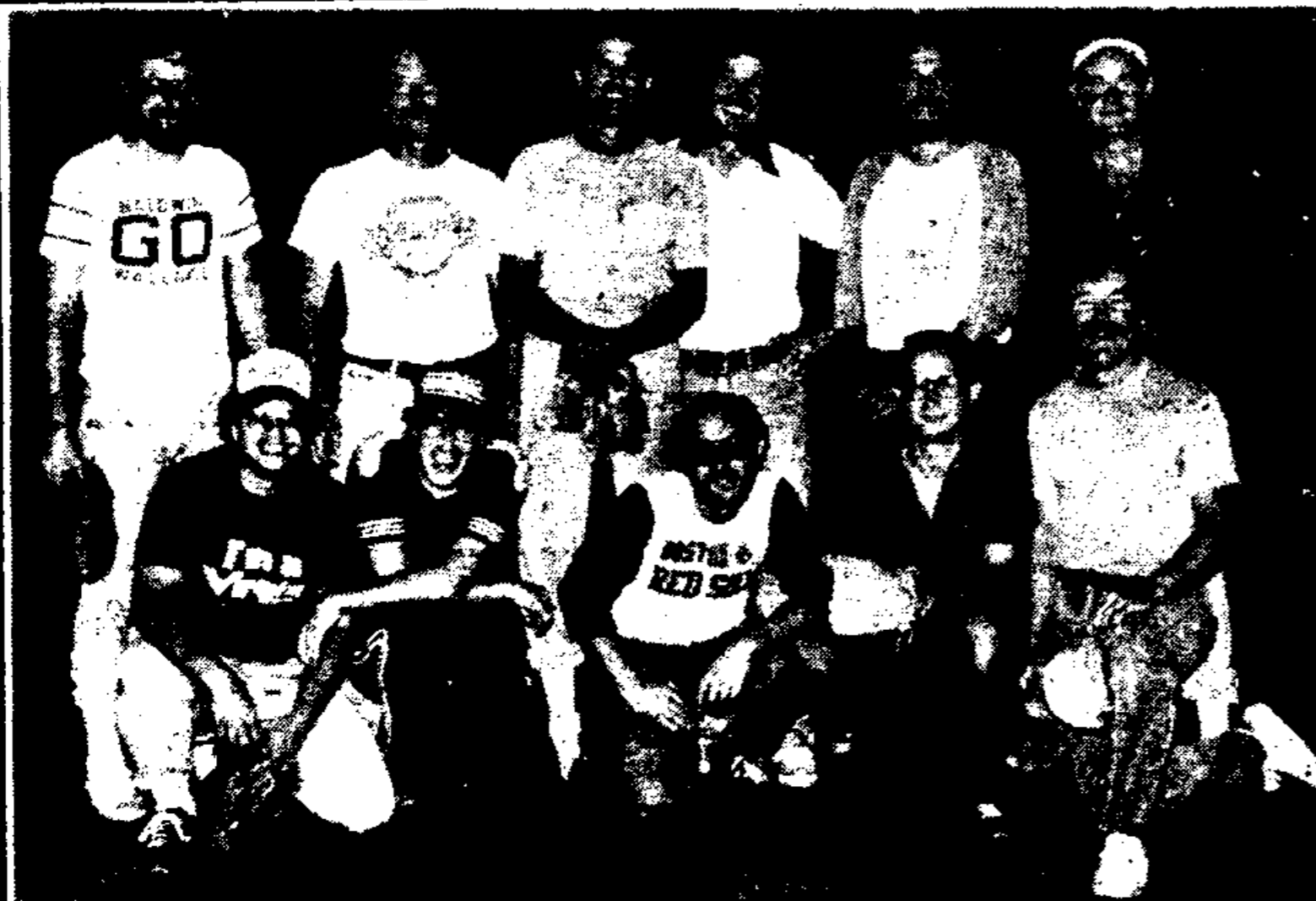
The Houyhnhms (Win 'Ems)