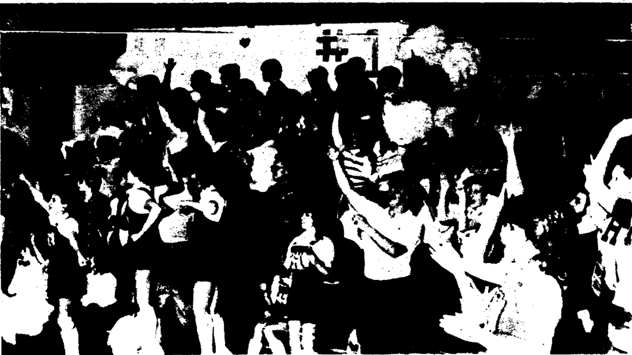
As usual, the Hannibal Warriors were supported last night by a large turnout of fans, as is always the case both home and away for the league leaders.