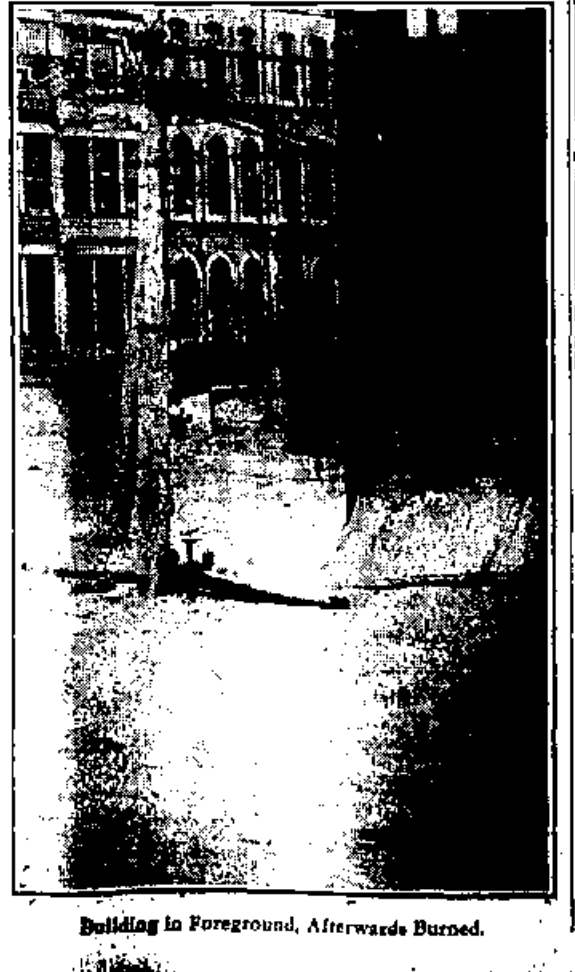
Building in Foreground, Afterwards Burned.