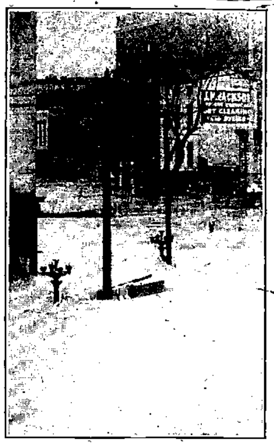
Note the Swimming Horse.

PH XII. And, young men and young women, when you find one of the oppo-