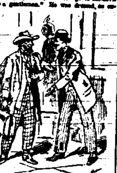
THEY GROW UP WITH US...