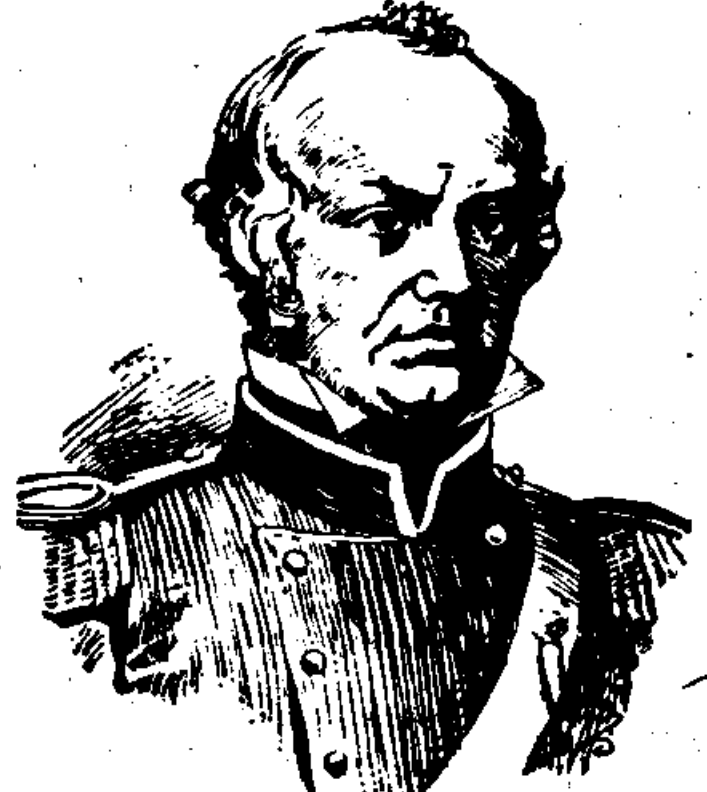
COLONEL E. D. BAKER, U. S. V. (Killed at Ball's Bluff.)

committee on the conduct of the war, but no charges were preferred against him. He was released after seven months' imprisonment and subsequently restored to active service under General Banks in the west.