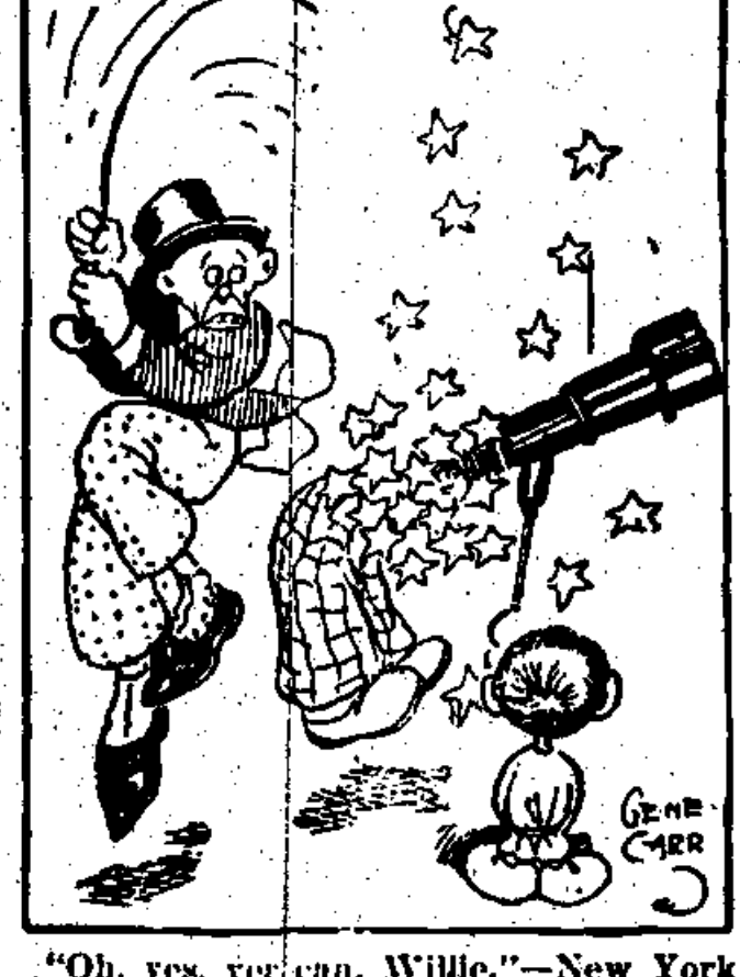
"Oh, yes, you can, Willie."—New York Journal.