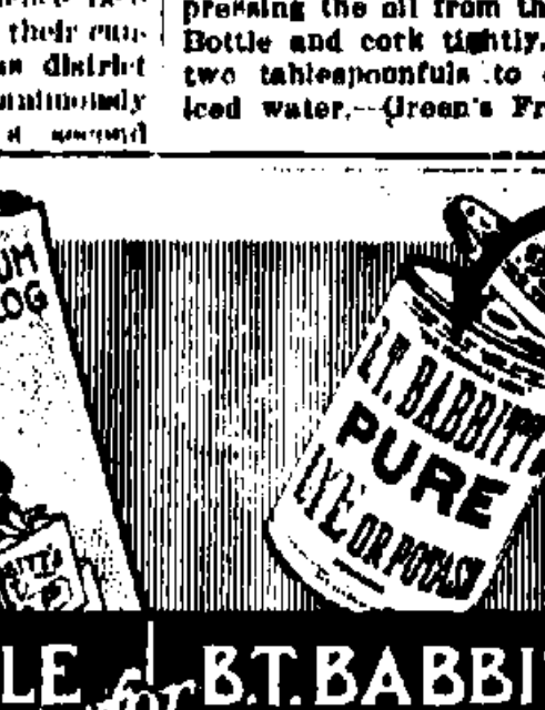
VALUABLE OF B. T. BABBITT'S PRESENTS OF LYE LABELS

Driving along the public road one day he saw a toad rubbing the road as if to get rid of the dirt. As he approached he saw that the toad was a large one and he was looking at it with a steady gaze.