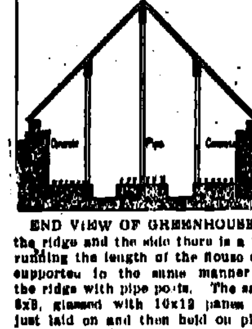
END VIEW OF GREENHOUSE.

The woman with the striped waistcoat had found her chain link from her mouth the last sample of calico she had been showing and she was looking at it with a steady gaze.