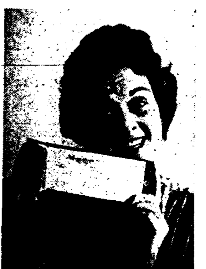
Thanks to MARINE MIDLAND CHECKS you can pay bills comfortably... by mail.

PAYING BILLS WITH MARINE MIDLAND CHECKS IS THE EASIEST THING IN THE WORLD. YOUR CHECK STUBS KEEP TRACK OF YOUR SPENDING. YOUR CANCELLED CHECKS PROVE YOU'VE PAID. OPEN YOUR CHECKING ACCOUNT AT MARINE MIDLAND SOON.