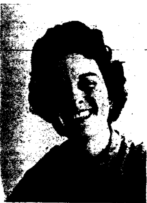
Now it's goodbye to tiresome bill-paying errands.