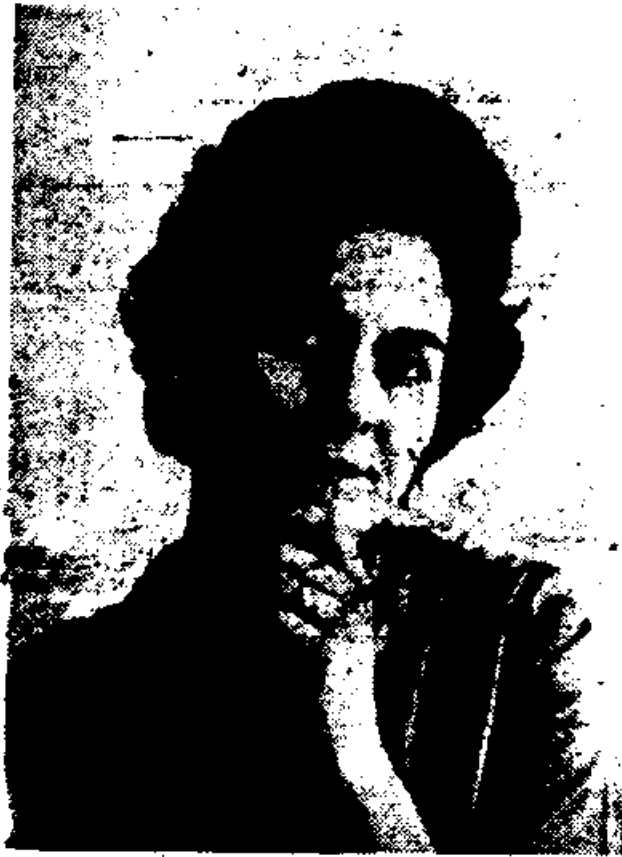
Once there was a housewife who ran all over town paying bills.