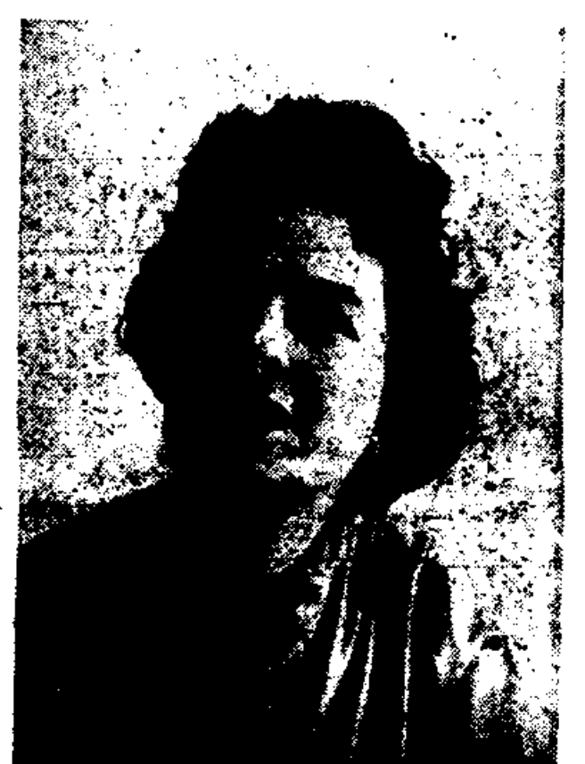
Until one day she heard about MARINE MIDLAND CHECKS.