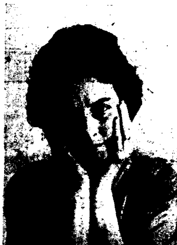
How tiresome! It really got her down ... paying in person left so little time for other things.