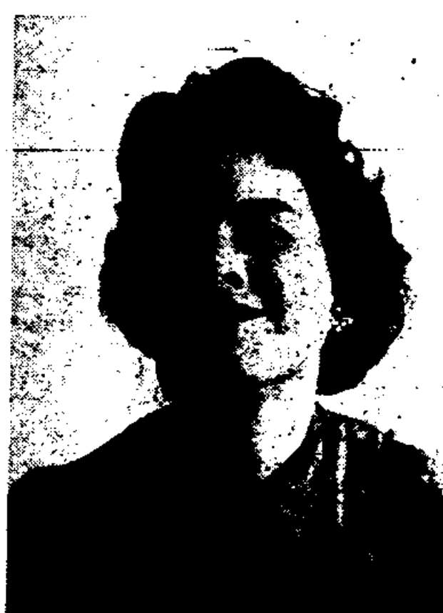
She simply writes MARINE MIDLAND CHECKS—drops them in the mailbox—and her bill-paying's done!