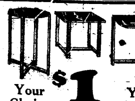
TABLE TOP SMOKING STAND —Walnut finish, commodious ash receptacle. Cash and Carry. Please. $1

Your Choice $1 Handsome walnut finish. Sturdy construction. End Table, Coffee Table, Lamp Table—Make your choice. Dollar Day at $1 each. Cash and Carry Please.