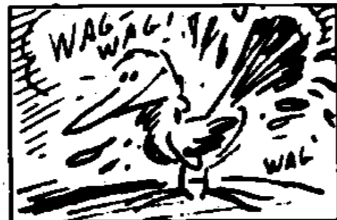
Old World wagtails, birds of a species related to the lark, get their name from their habit of jerking their long tails up and down.