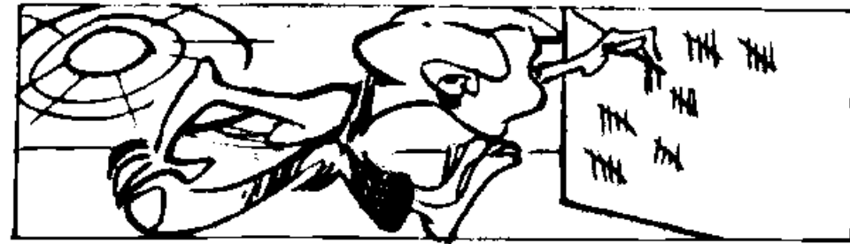
The longest hot spell on record occurred in Marble Bar, West Australia, when the average temperature was 100 degrees Fahrenheit or above for 162 consecutive days.