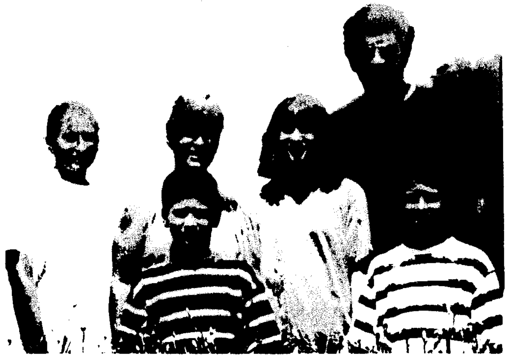
New chamber member