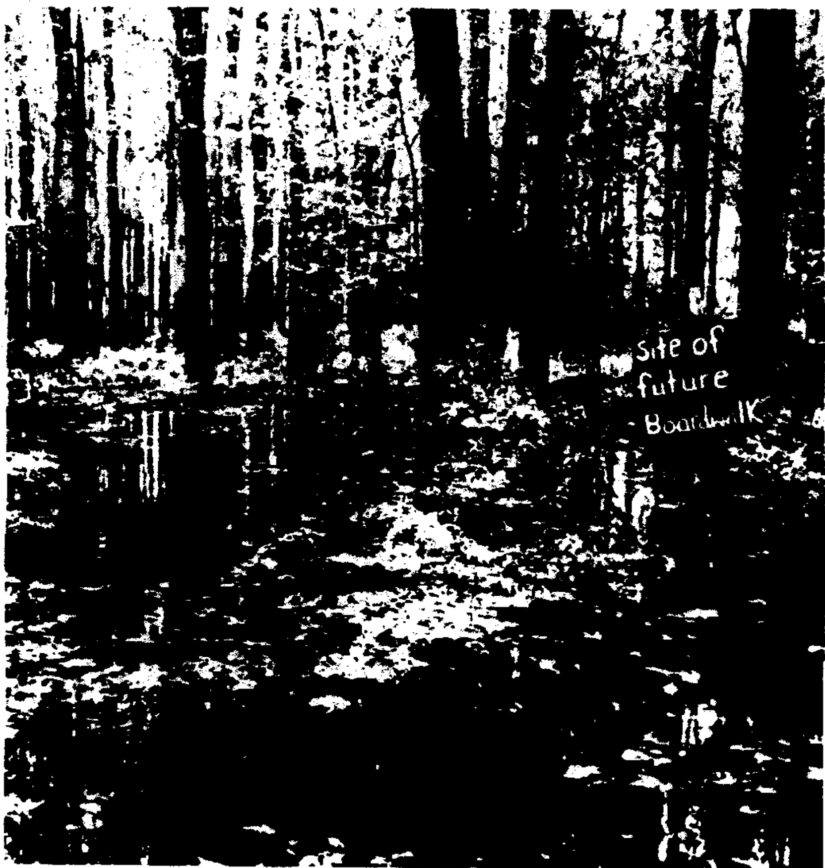
Perhaps a pontoon bridge

Pictured above are some of the Palermo youth who took part in a skating trip this summer with Palermo Day Camp '90. The Palermo Recreation program plans two trips Oct. 13 and Nov. 10.