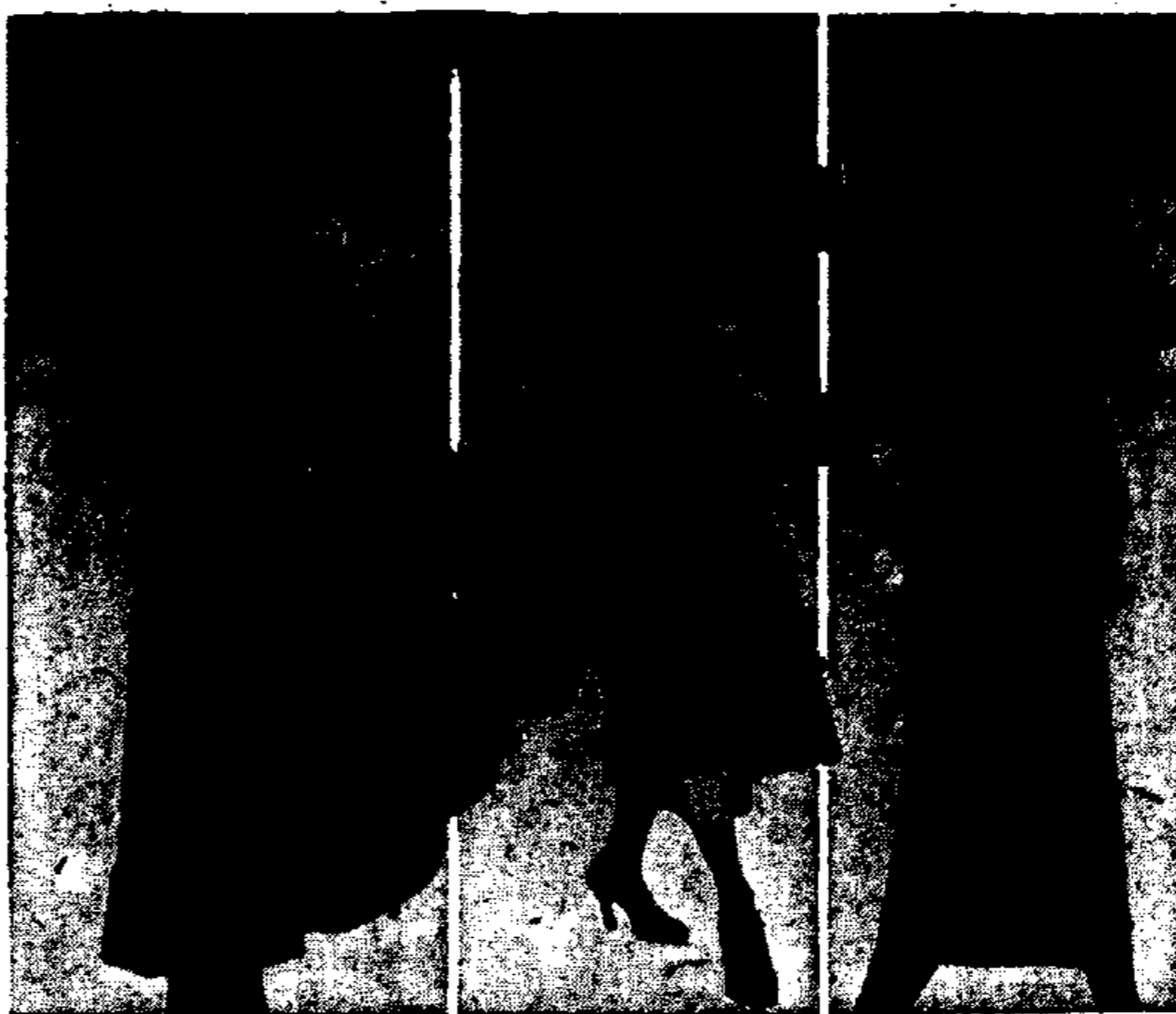
FIFTY YEARS AGO ... In 1898 the standard house dress was a calico wrapper with matching cap, evolving to the "Mother Hubbard" of 1904 and the "Billie Burke" of 1915, shapeless garment which daringly exposed the ankles.