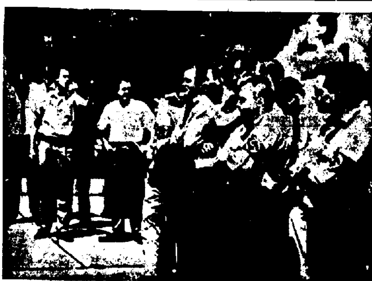
ROCKWELL — Surrounded by Swastika-wearing members of his American Nazi Party, George Lincoln Rockwell yells back at a heckler, top left, during a rally yesterday in Judiciary Square in downtown Washington. Rockwell, self-styled leader of the Nazi group, was refused permission to hold a rally on the Mall where violence broke up the meeting. Rockwell moved his followers to the square where the rally was held without violence but with much heckling. More than a score of policemen were on duty at the rally to maintain order.