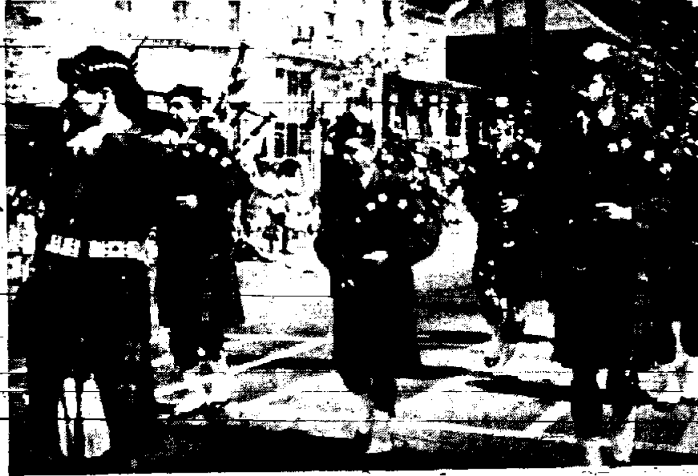
The Kitties of Syracuse.