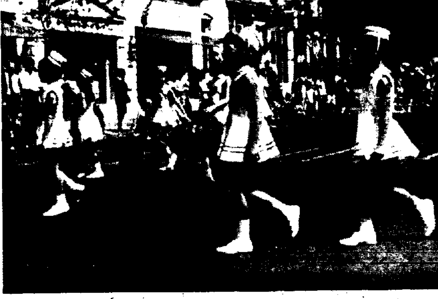
Minerva Majorettes March.