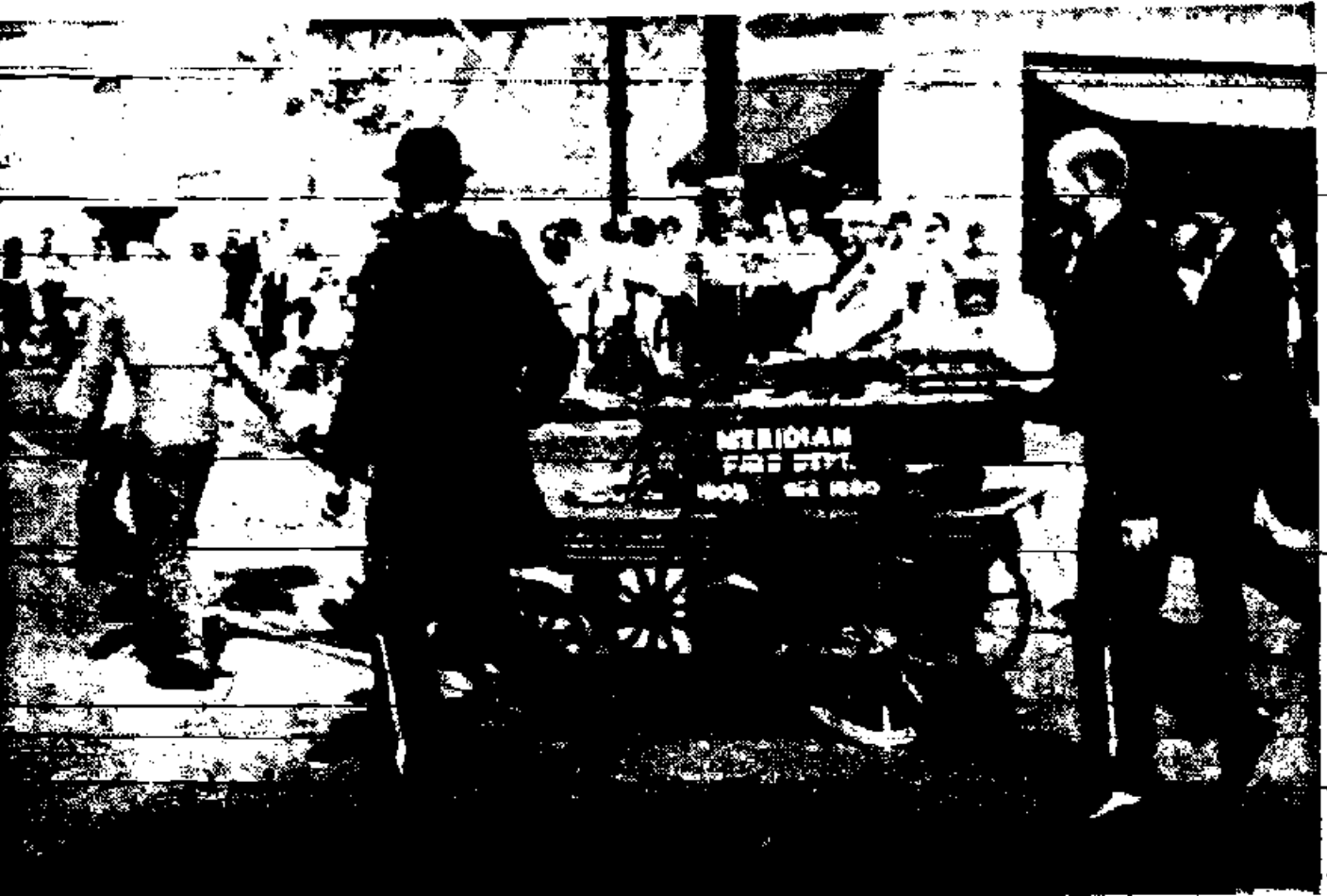
Meridian Firefighters Display Vintage Pumper.