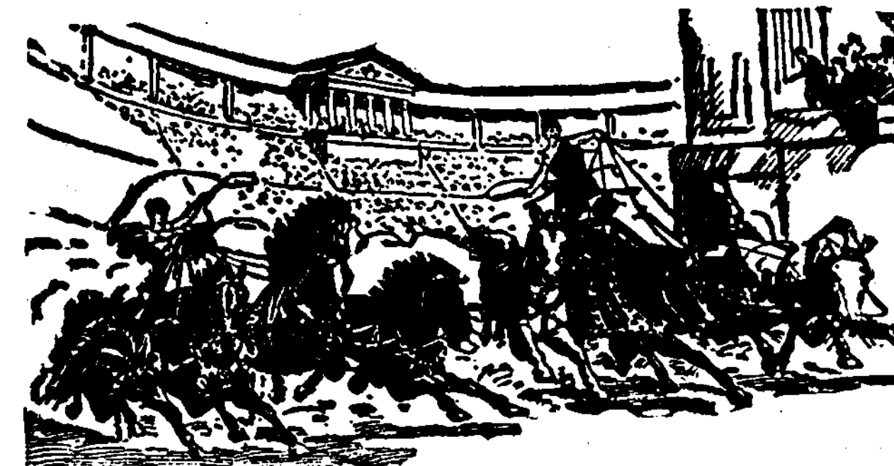
EIGHT HORSES IN THE THRILLING CHARIOT RACE