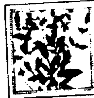
PEPPERMINT (Mentha Piperita)