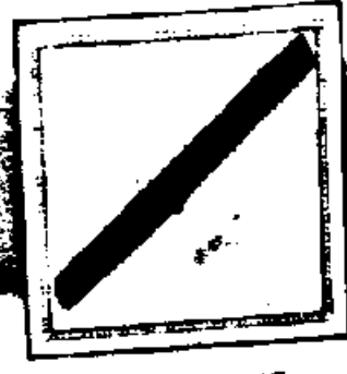
SUGAR CANE (Saccharum Officinatum)